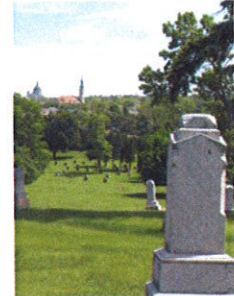
Historic Calvary Cemetery in St. Paul was founded in 1849.

The Archdiocese of Saint Paul and Minneapolis is committed to provide Christian burial for generations to come. The Catholic Cemeteries will provide the highest standard of care and service for all. All cemetery activities, whether temporal or spiritual, will be centered on the resurrection faith of the Church. The Catholic Cemeteries, in cooperation with parishes, will be places of ministry to the bereaved, of evangelization and catechesis, and of worship and prayer.