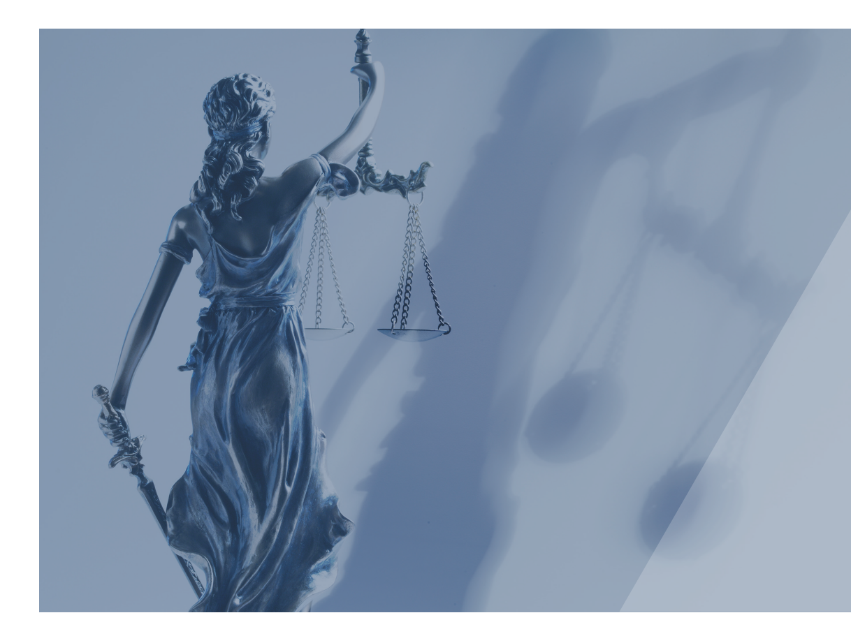
New York IRCP Settled Claims & Alleged Perpetrators