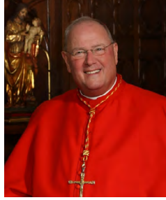
Cardinal Timothy Dolan