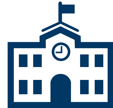
ST. FRANCIS PREPARATORY SCHOOL Fresh Meadows, New York