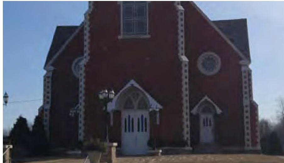
CHURCH OF THE HOLY ANGELS